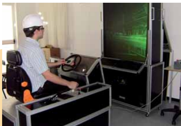
Practical training by using simulators

In the central machinery pool efficiency is higher than expected because the protocol has brought about increases in operability, performance, efficiency and qualification of machinery and personnel. There has been a fall in work-related accidents during maintenance and repair operations, an improvement in machinery operating conditions and an improvement in the performance of the equipment due to decreased stoppage and breakdown times. It also has a significant impact on the health of the employees who work on or near the equipment during their time on the job site, although this impact is difficult to quantify.