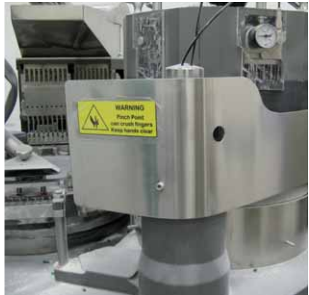
New guards to cover area where there are moving parts

Adjustments made to the equipment minimised the risk of an accident. Following a proactive approach, a risk assessment is carried out for new tasks and new equipment to ensure that maintenance and operation can be done safely. The most important achievement is that employees are now fully aware that maintenance has to be carried out in a safe manner, resulting in a change of the safety culture.