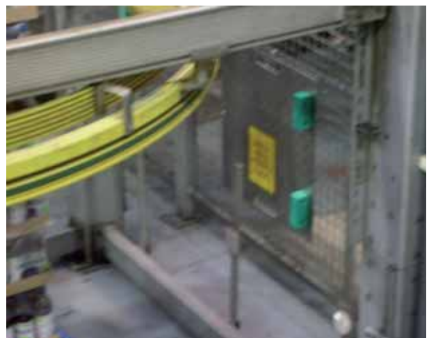
The Palletiser Maintenance Board developed at Britvic Soft Drinks