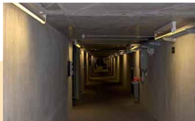
An underground corridor allows staff to move around safely without risk from high voltages