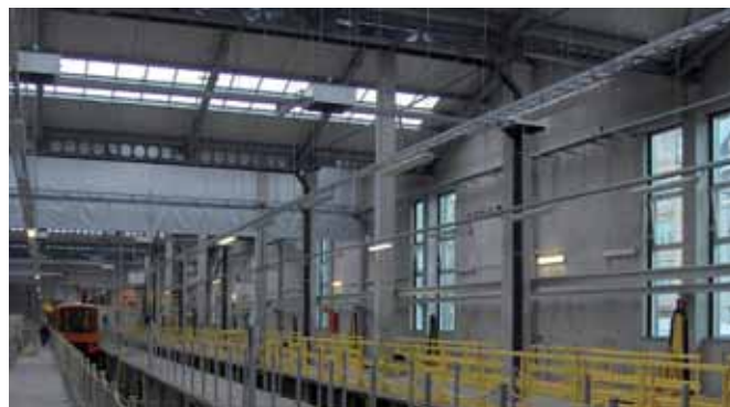
Openings and outlets on the roof and on the side of buildings substantially improve lighting

Each of these accidents has been analysed. This has led to preventive and corrective measures to avoid recurrence.