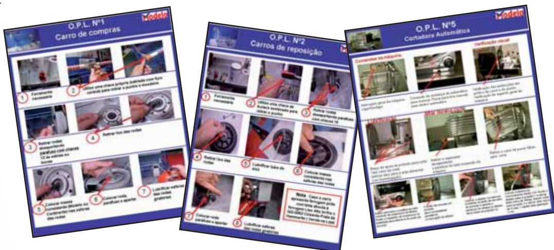
Examples of ‘one point lessons’ (OPLs) on the maintenance of shopping trolleys and slicing machines respectively

The solutions found have brought considerable benefits in terms of reducing accidents at work and increasing all workers’ risk awareness. They have also resulted in a considerable decline in the insurance premiums paid by the group to cover accidents at work. After the maintenance safety project was introduced, accident premiums fell by about 31%, which translates to a saving of €1,002,760 compared to the amount paid in 2006.