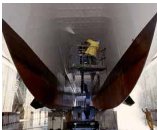
The dry dock at Concarneau, Brittany

No accident has been recorded on this site for more than three years. From some perspectives, improvements in safety issues might be seen as unproductive investments. However, the current demands on the ship repair sector in terms of quality and productivity are very high, and many workers are involved in the activities. The job requires skilled and experienced employees who are difficult to replace in case of absence. Therefore, a low absenteeism rate is an absolute must for the smooth running of a repair dock. A management aiming at improving working conditions and preventing occupational diseases and accidents is essential for the achievement of these objectives.