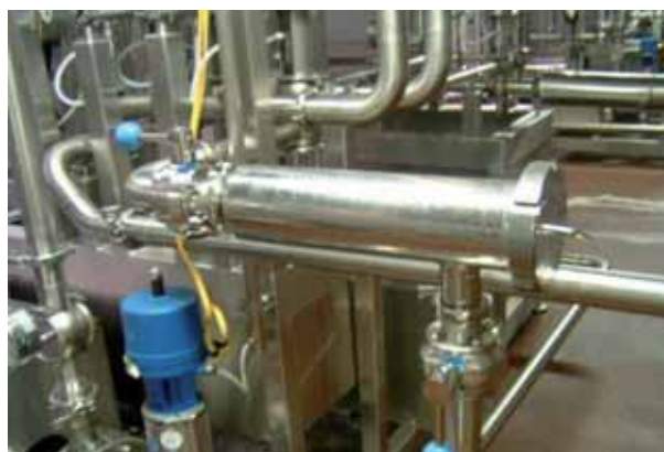
Installed isolation valves

The result of this initiative is that, at the time of writing, the plant had gone 19 months without a lost time accident on this site. The major cost benefit is the avoidance of lost time accidents, which mean bringing in temporary employees to cover those off sick through injury. There is also the avoidance of potential downtime in the plant while incidents/accidents are investigated.