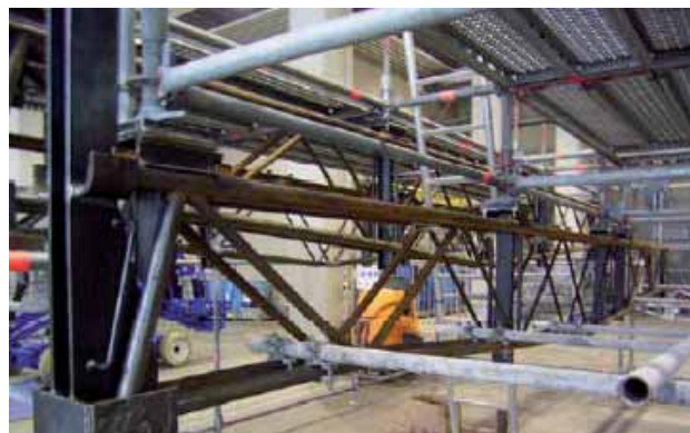
'Saddles' for the special lattice girders