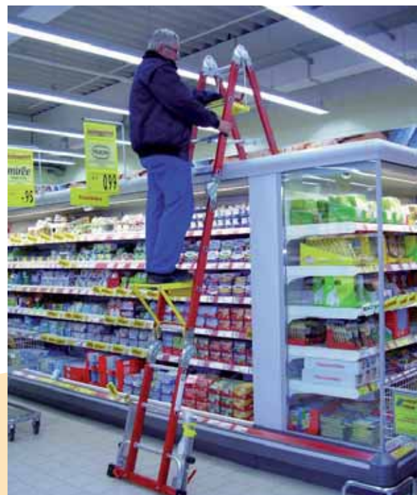
Working on the refrigeration system with asymmetrical fibreglass ladder (with mounted platform and storage tray)

Since the ladder was introduced, no accidents in connection with work on refrigeration system roofs have been recorded.