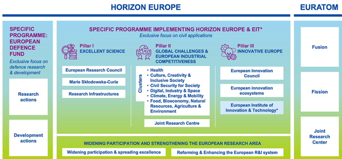
Figure 3: Specific Horizon Europe implementing programmes